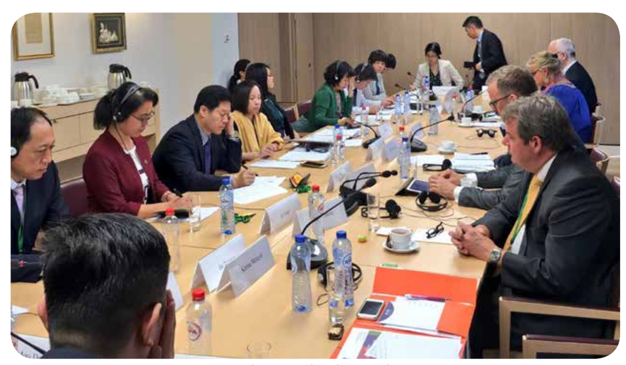
EU-China Human Rights Dialogue, Brussels

but silence, except on the case of Xie Yang. A wealth of details. Unverifiable ones, sometimes contradictory. The progress of the system of detention, and the prevention of torture were praised. It was affirmed that torture is severely repressed, that guards are now closely monitored. We were invited to go to China and see it for ourselves.